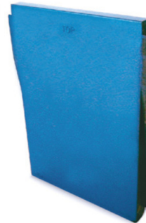
Ophanginrichting LZ 1010